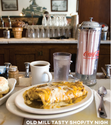
OLD MILL TASTY SHOP/TY NIGH