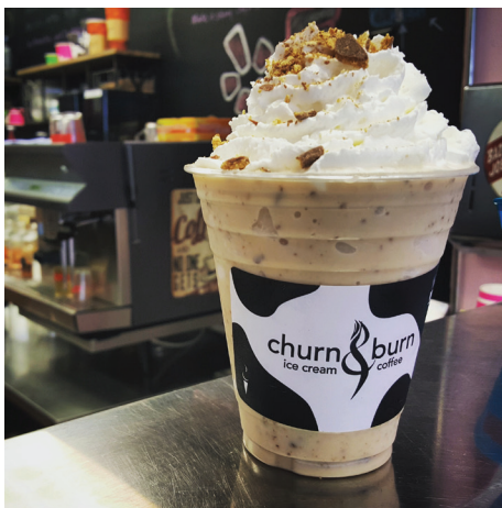
CHURN & BURN/COURTESY