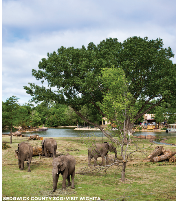
SEDGWICK COUNTY ZOO/VISIT WICHITA