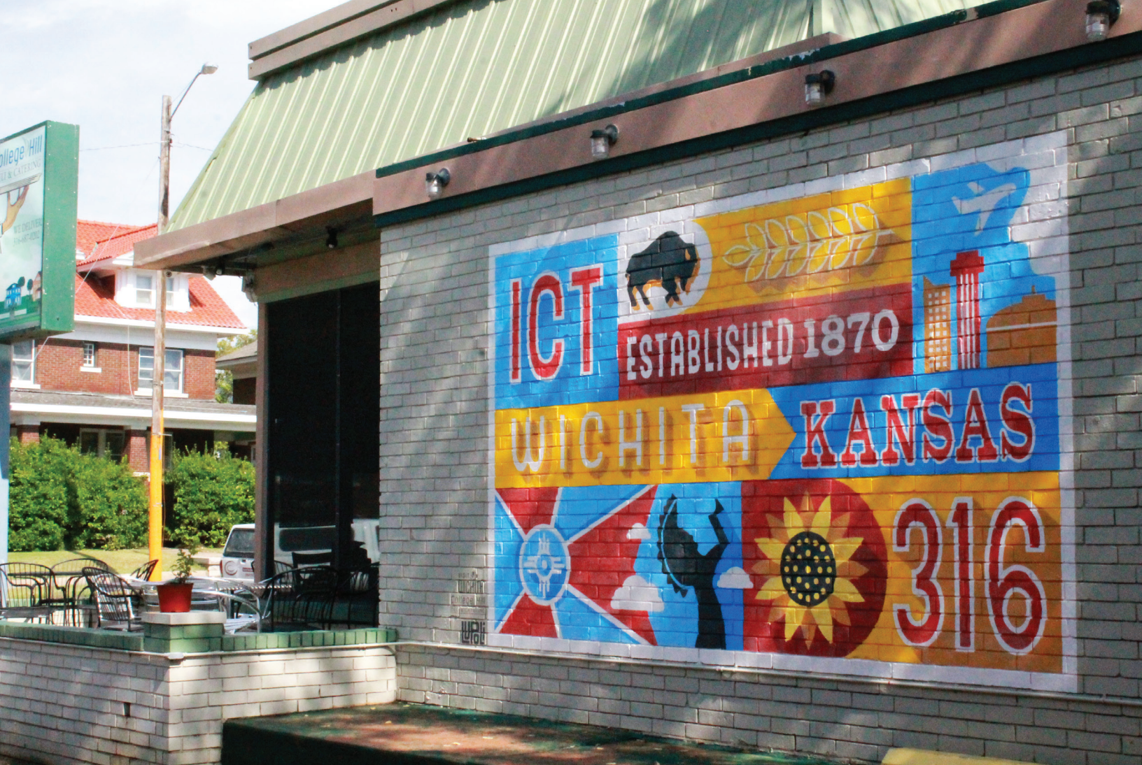
WICHITA COMMUNITY MURAL/VISIT WICHITA