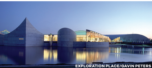
EXPLORATION PLACE/GAVIN PETERS